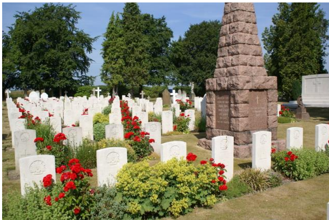
Durrington Cemetery, Wiltshire