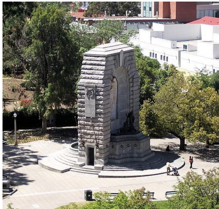
Adelaide War Memorial

Pte W. Ross is also remembered on the South Australian National War Memorial, located on corner North Terrace and Kintore Avenue, Adelaide. (Panel 7, column 2)